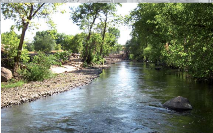
After river restoration

Facilitating the community at the interface between urban and natural areas was an overriding goal of the restoration project. Paths were aligned for a widened riparian zone and concentrated access. The river used to be the back door waste conveyance. Now the community embraces the river as a valuable resource running through the heart of the City.