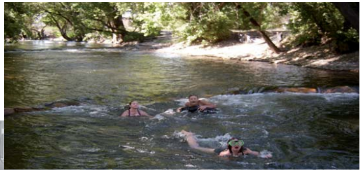
Kids love swimming the rapids