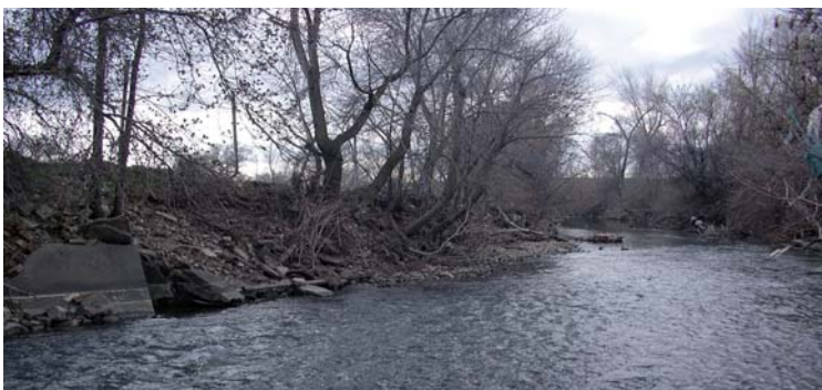
Before river restoration