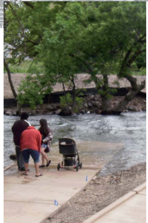
Accessible wade fishing