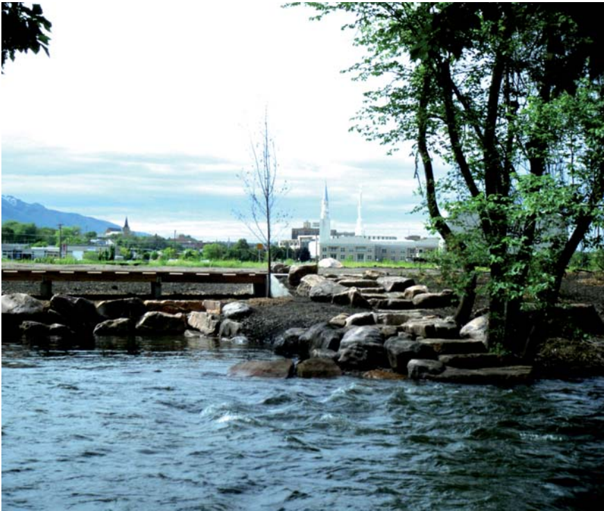
Ogden City's new riverfront